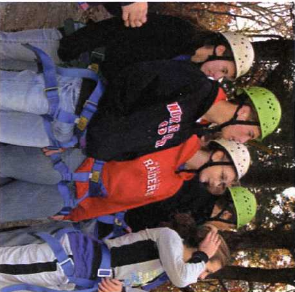
Key Leader students prepare for zip line on confidence course.