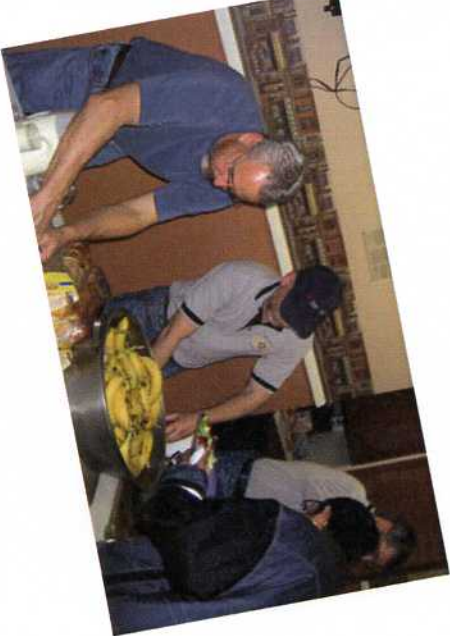
Serving meals at the Stephen Center